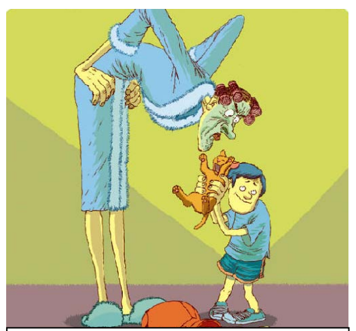
Hitting adults is called assault. Hitting animals is called cruelty. Hitting children is "for their own good".