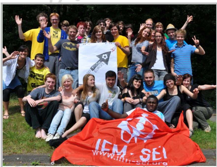
The first training course for All Together Against Climate Change Project